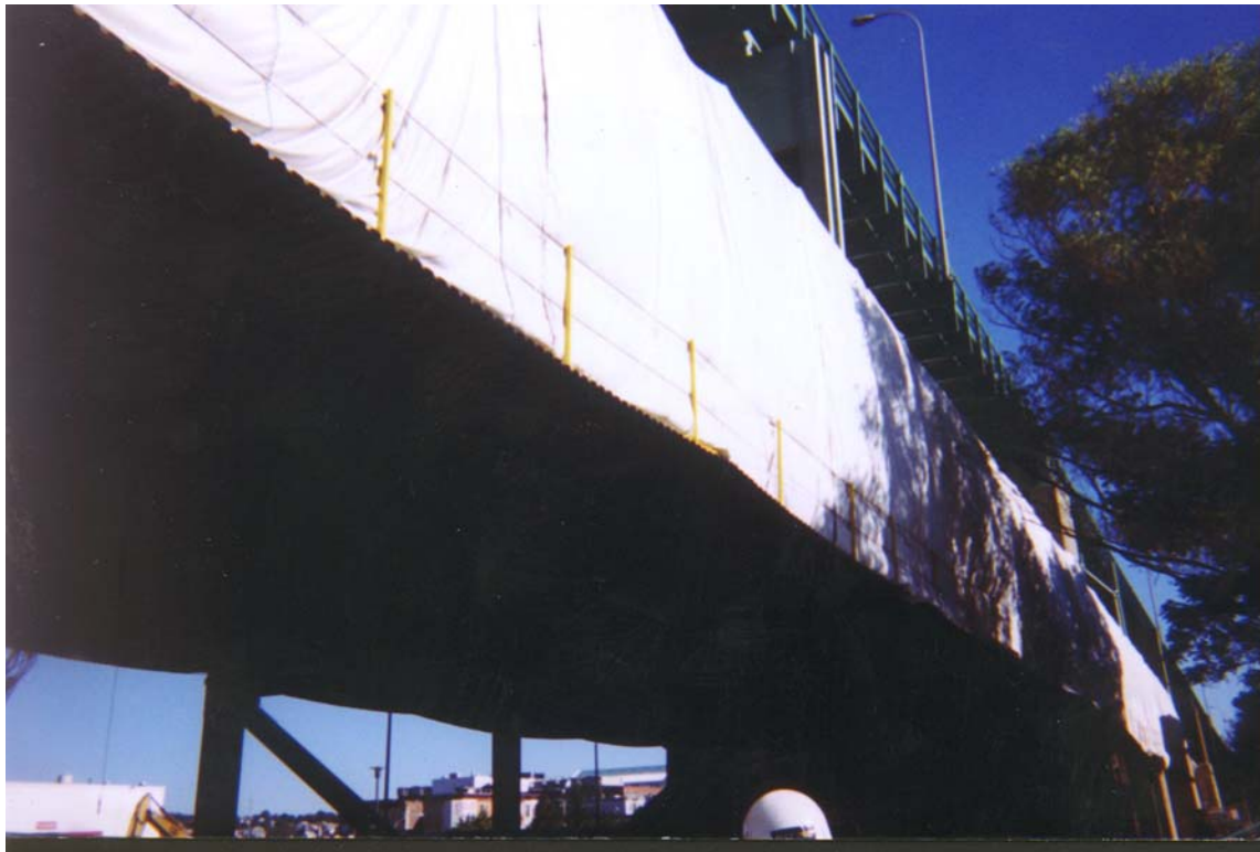
Side wall Containment & blasting & painting platform